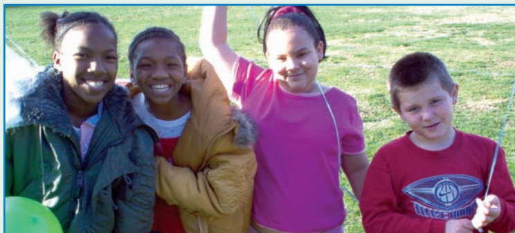
East End Heritage School Group

From October through December, 104 children and teens and 73 adults joined our evening support group program. We welcome all 177 new group participants to our program.