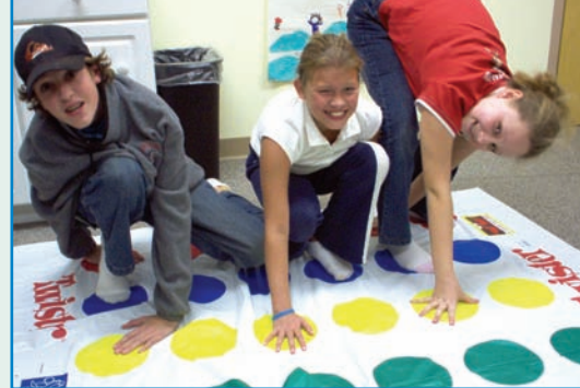
Thursday Extended Loss Group

Two Fernside facilitators recently came up with a great new group