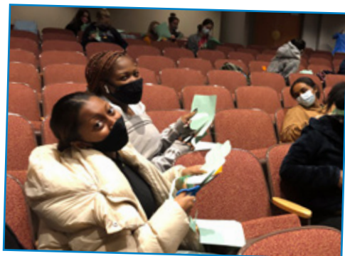
Mercy McAuley High School Service Learning Day

Our Community Outreach & Education Program showed us that we can adapt easily in a virtual world. Over the past year, we've been able to offer several virtual educational grief presentations to many audiences. We still love connecting in person and have adapted doing so safely.