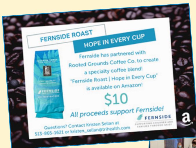
Fernside & The Bethesda Foundation Team Member Tasting