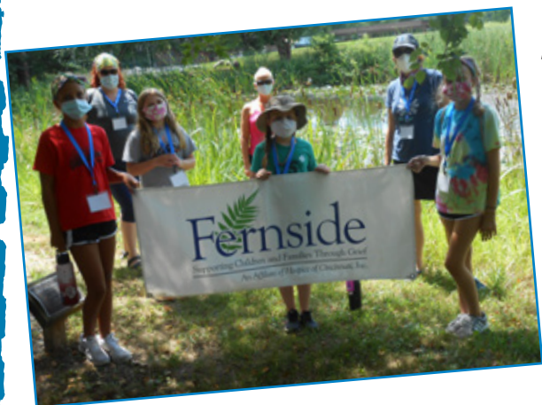
A scene from summer camp 2020

"My child had a great camp experience. She talked about it the whole way home. Being able to spend time with other children who have experienced a similar loss was helpful for her, because she knows that she isn't alone. It was also so helpful to have fun and do kid stuff with other kids. She enjoyed the time with other kids, especially since we've been so isolated recently due to COVID."